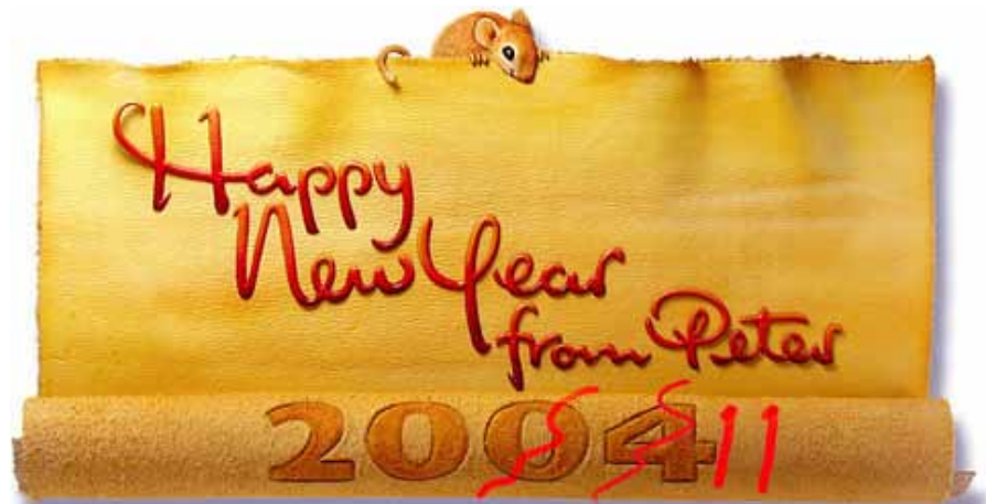
...another recycled card!