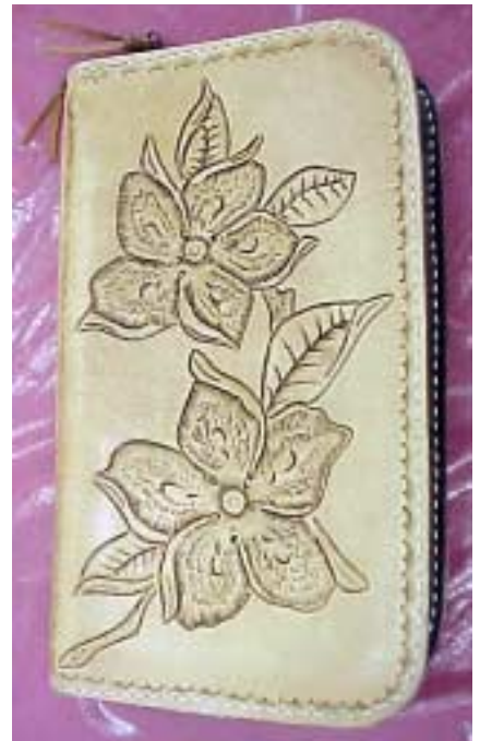
Zippered Case by Woody Collins