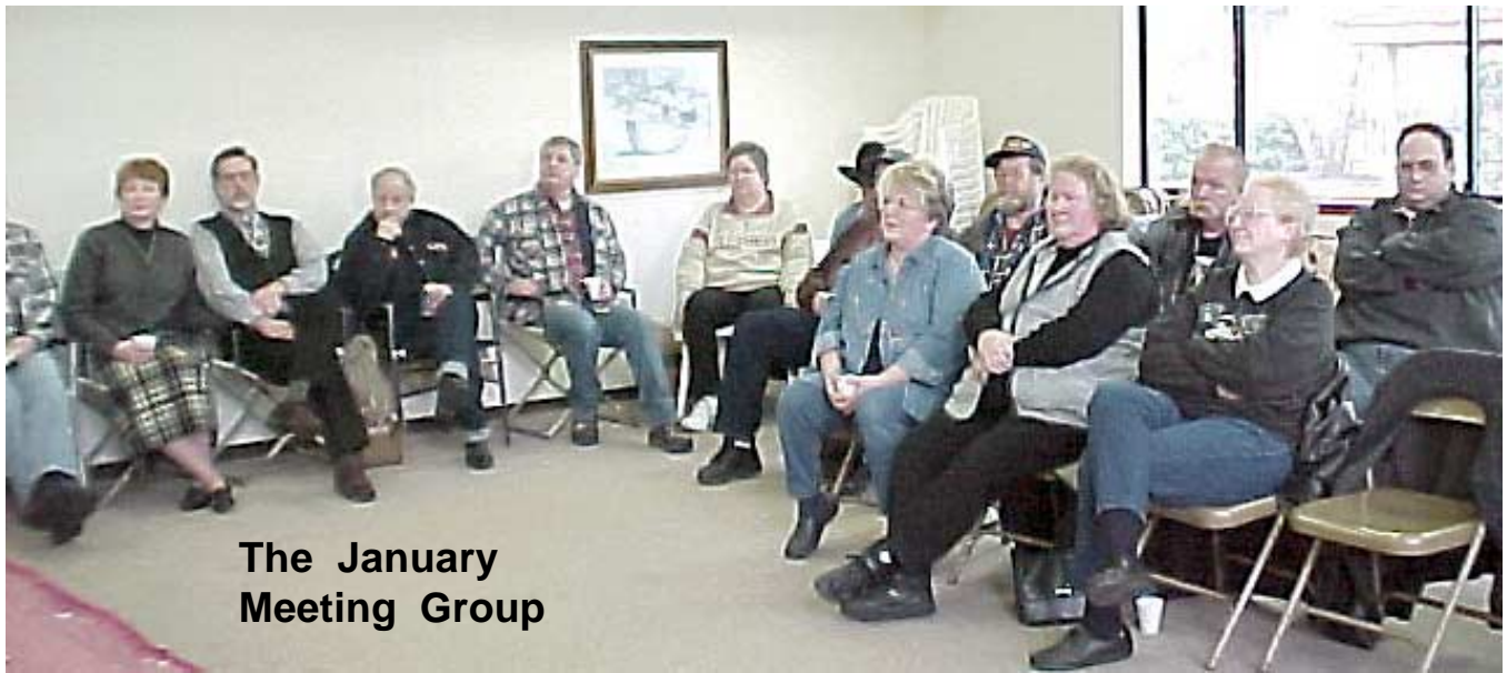
The January Meeting Group