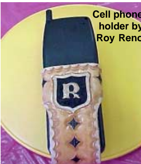
Cell phone holder by Roy Reno