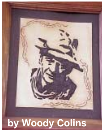
by Woody Colins