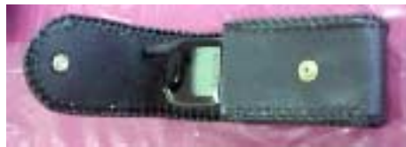
See Fred Nachbar's article in the LC&SJ for this cell phone case