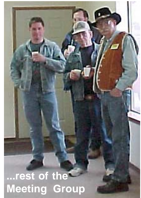
...rest of the Meeting Group