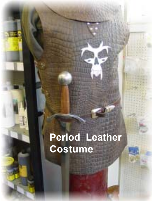
Period Leather Costume

TWLeather, Inc. Offering a wholesale discount to the PSLAC members