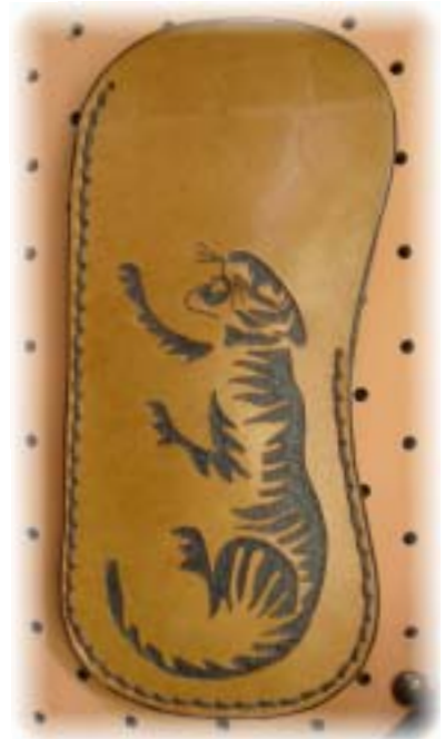
Eye Glasses Case

size 12. Please follow the directions below to make sure you get the proper size.