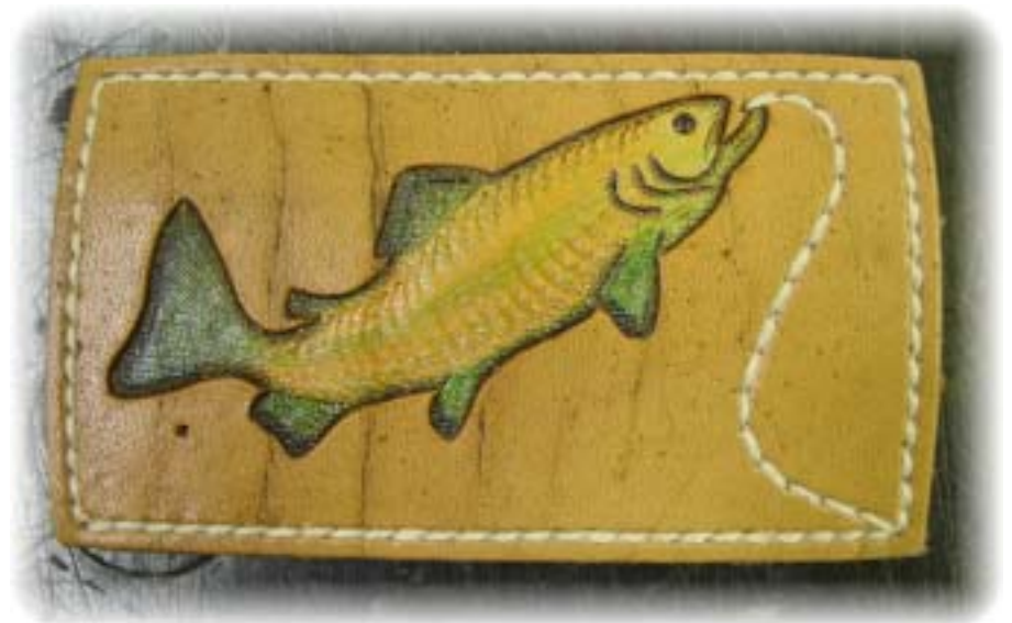
This fish design was a clever use of the sewing thread—looks like the fish has been hooked

Confidence Observation Practice Imagination