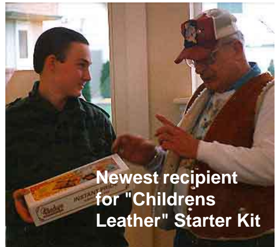
Newest recipient for "Childrens Leather" Starter Kit