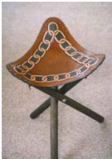
Therry Shinaberger's Three Legged Stool