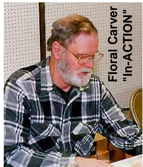
Floral Carver "In-ACTION"