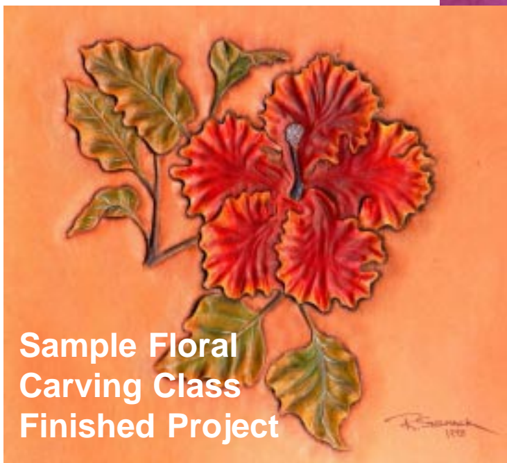
Sample Floral Carving Class Finished Project