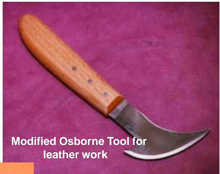
Modified Osborne Tool for leather work