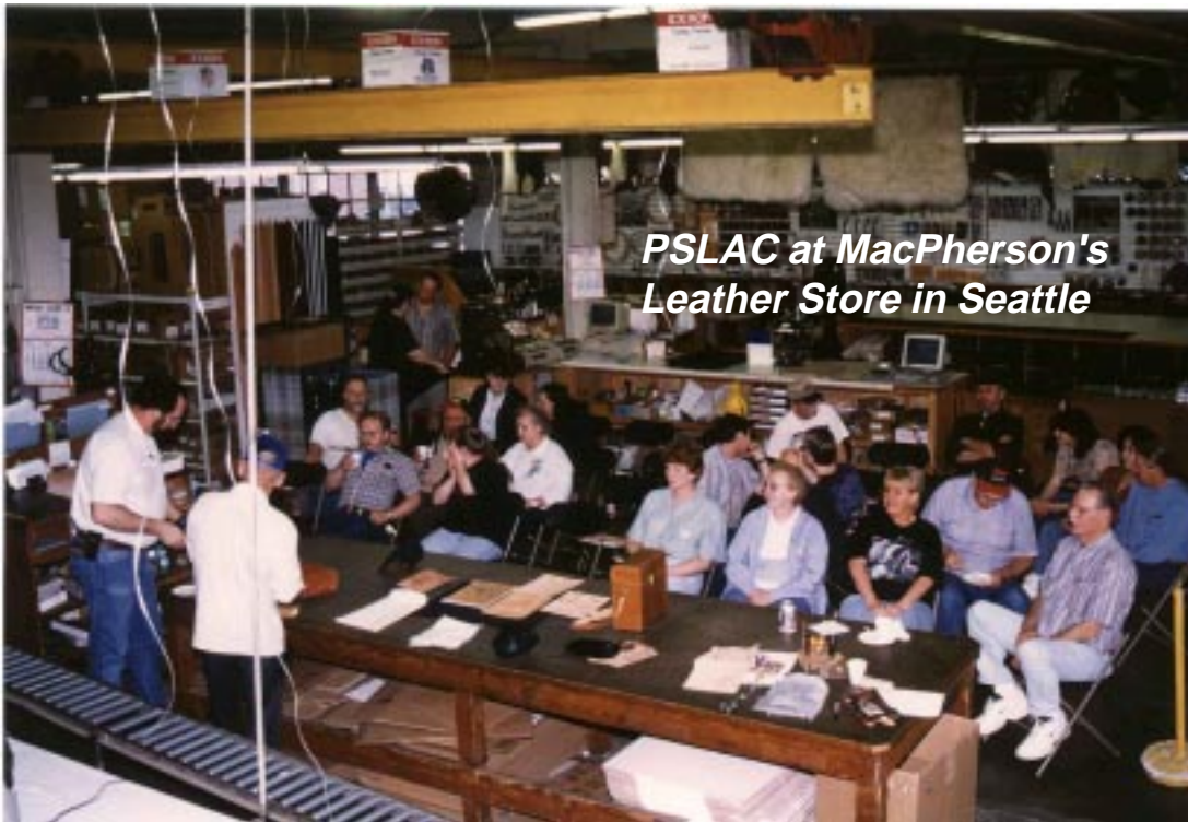
PSLAC at MacPherson's Leather Store in Seattle