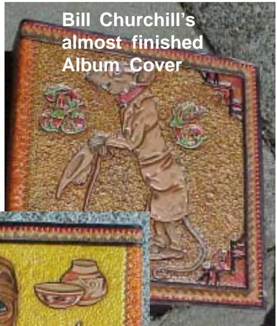
Bill Churchill's almost finished Album Cover

The Leather Factory -- Billings Offering a wholesale discount to the PSLAC members