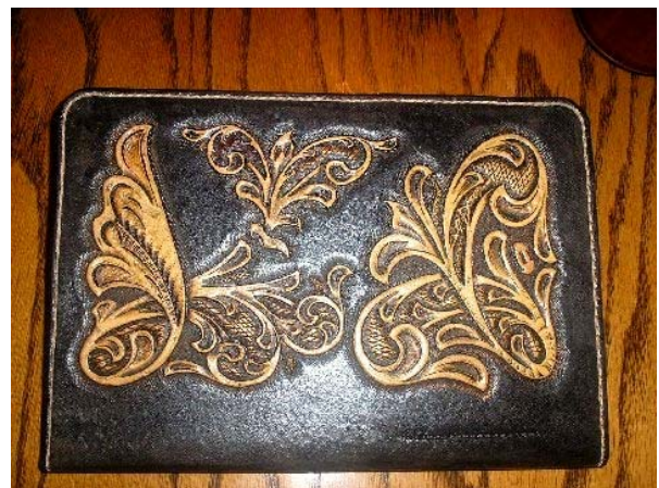
Front and back of a notebook