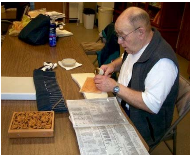
Practice, Practice, Practice