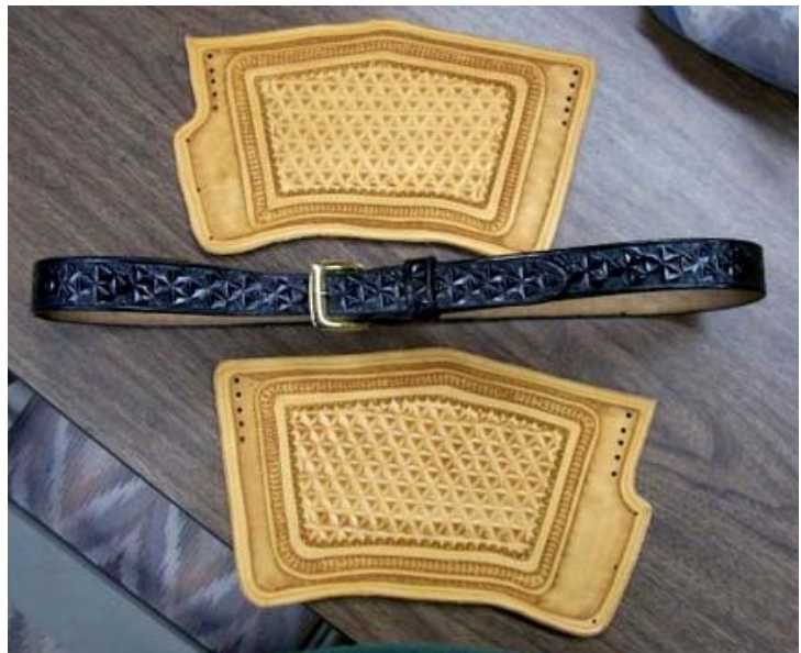
Len's Cowboy Cuff project & a belt testing new tools