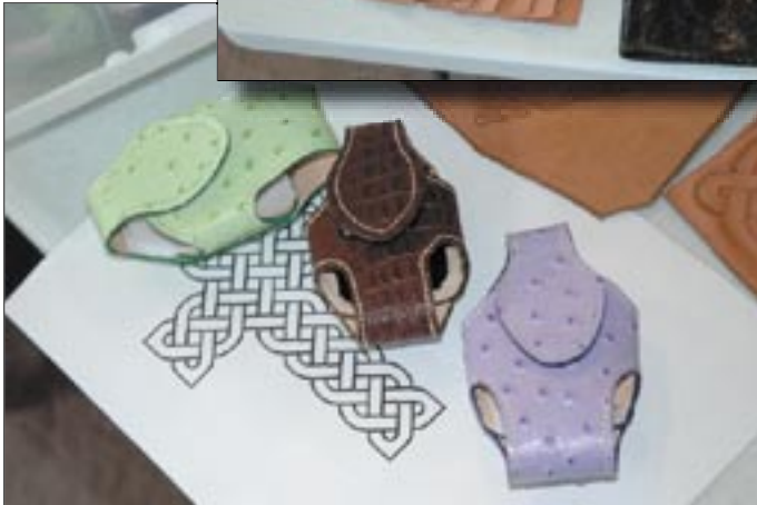
◀ Ivan's fancy cell phone cases using Tandy's embossed alligator and ostrich leathers over a vegetable tanned base for strength.