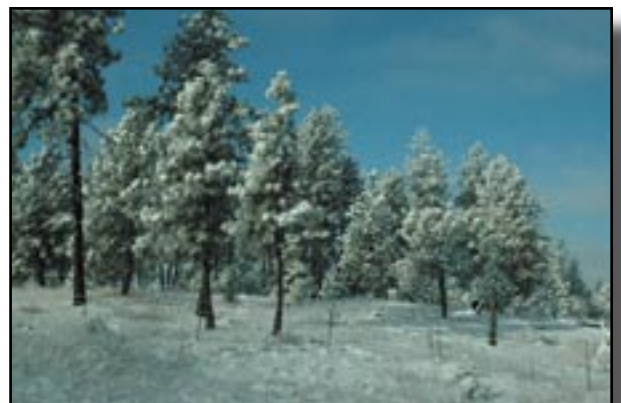
Spokane in the Winter