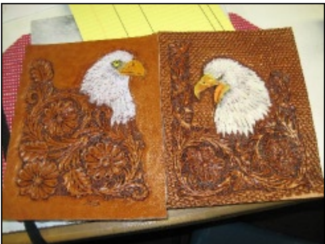
Woody's latest Eagles.