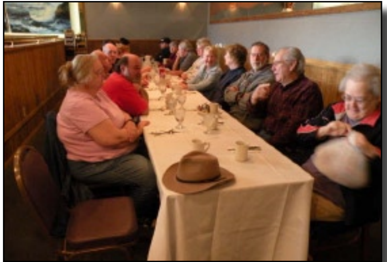
PSLAC South Breakfast Meeting

Ken Bush White Rose Leather 11923 E. Fairview Ave. Spokane Valley, WA 99206 whiterosex@aol.com 509.926.2087