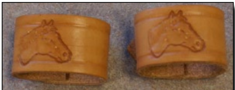
▼Phil O'Neils' napkin rings and knife sheath▼