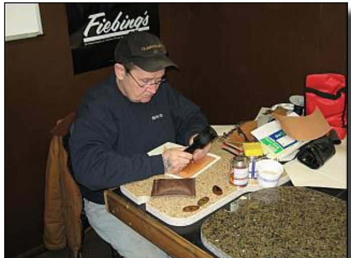
Woody prior to the rush