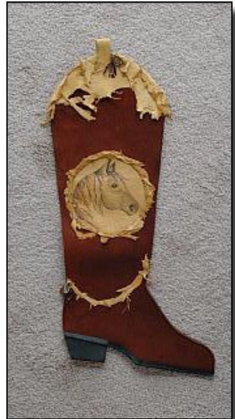
(above) Close-up of Western Style Christmas stocking, (right) Western Style Christmas stocking, (below) pre-embossed leather and same type of leather with coloring, (right/bottom) checkbook holder made from sting ray and hippopotamus.