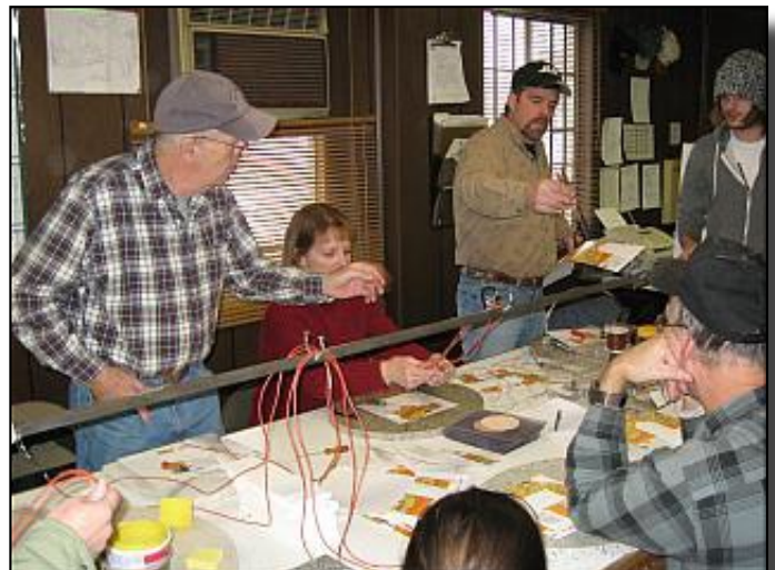
The braiding jig in action