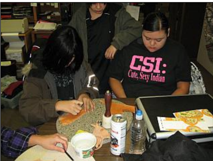
Three of the newbies