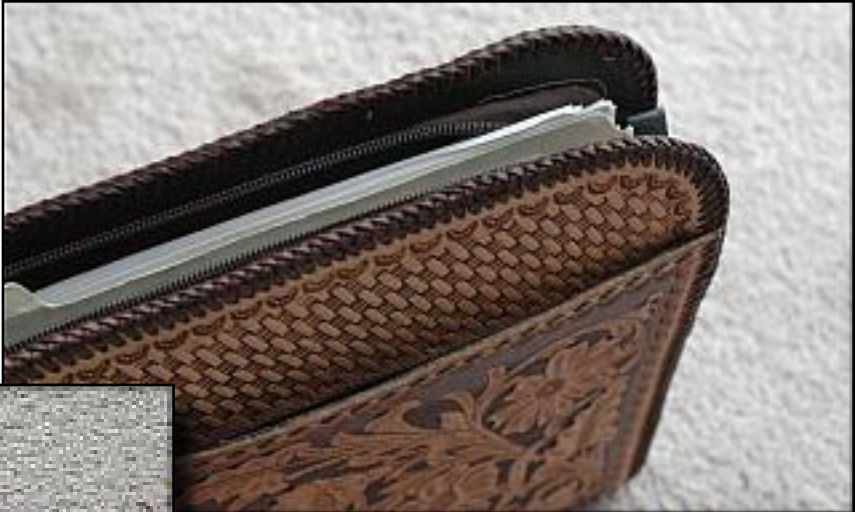
Larry's new portfolio