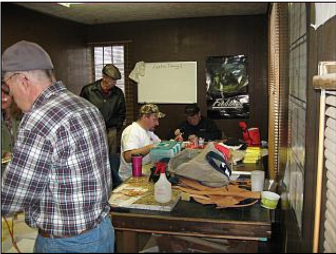
Woody assisting a student with questions