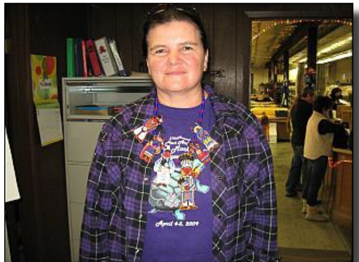
Mom who loves purple with her beaded necklace