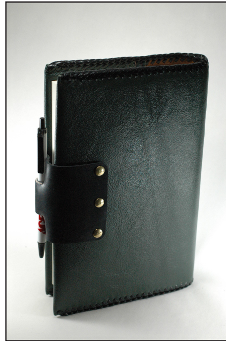
Combination book cover snap/strap and pen holder