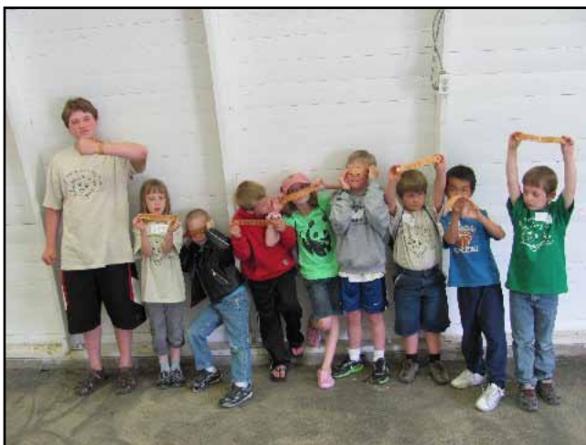
4th group. As you can see, each group has it's own personality.