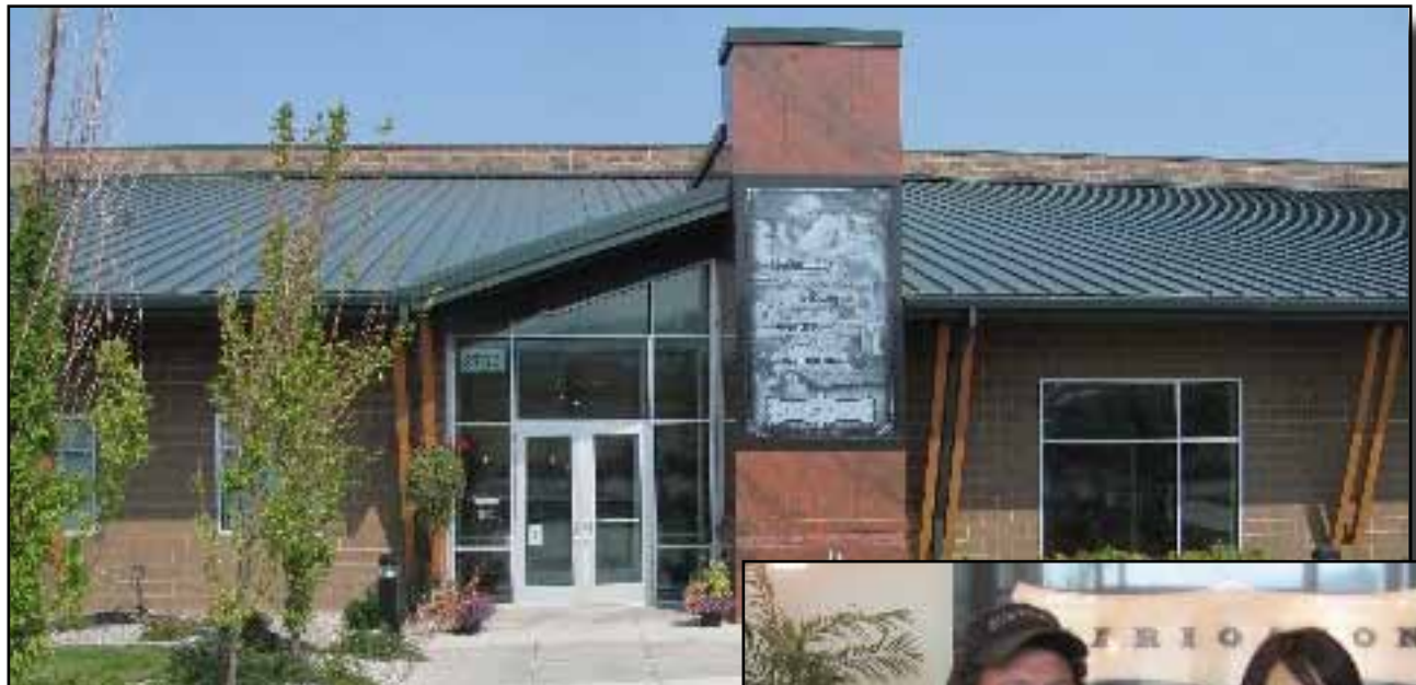
This is Mario & Sons near Liberty Lake WA. Many thanks to them for their generosity.