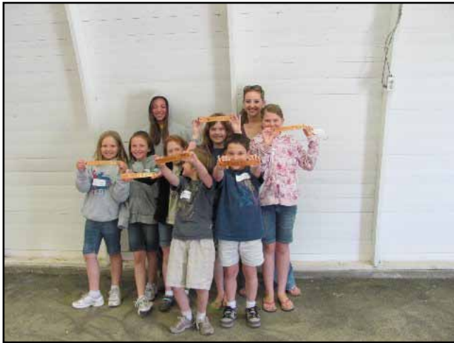
1st group. Each group of kids had a 4-H aide to help us.