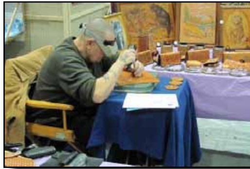
Photo 1: Woody demonstrating the craft for customers at the CV show.

White Rose Leather 11923 E. Fairview Ave. Spokane Valley, WA 99206 whiterosex@aol.com 509.926.2087