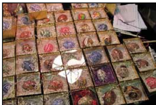
Photo 4: Notice the intricate detail in her eggs. I believe she uses duck eggs. You have to see them up close to appreciate.