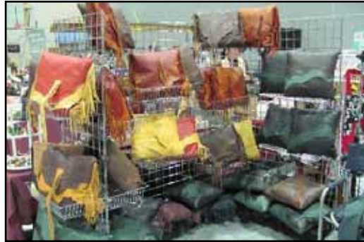
Photo 2: Pillows from my earlier sewing phase. I got the idea for the designs while vacationing at Kalaloch and watching the wind blow sand around pebbles on the beach.