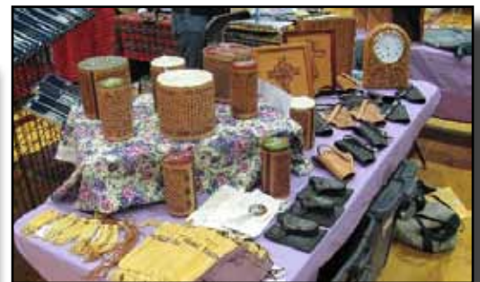
Photo 7: More of my phases at the U-Hi show. Obviously the major influence after my sewing phase comes from Chan Geer and his Sheridan style carving and basket stamping. Holsters are becoming my latest phase.