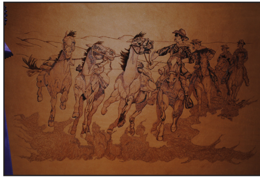
Another of Fred's prize-winning efforts.

One of the big things we all learned was the quality of the leather that we are burning makes a big difference in the results obtained. The better the leather is tanned the easier the pens flow and more even the burning process.