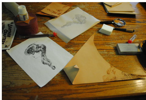
The pattern for the workshop and some practice pieces.