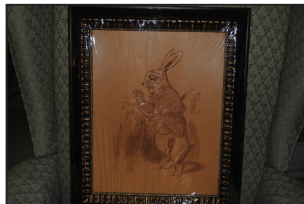
Fred Nachbar's rabbit burned in leather.

He'd given us the Continued on next page