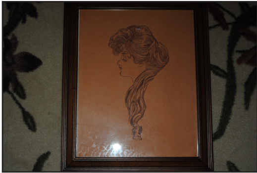
This was the project for the class.