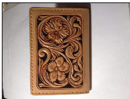
Name card case

This is from Ken Bush and it looks like a really great workshop from an extremely talented lady. A good