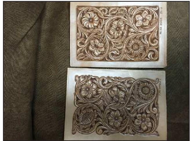
A5 Panel examples (just one of these in the class)

Here are some pictures of Akiko's award winning work