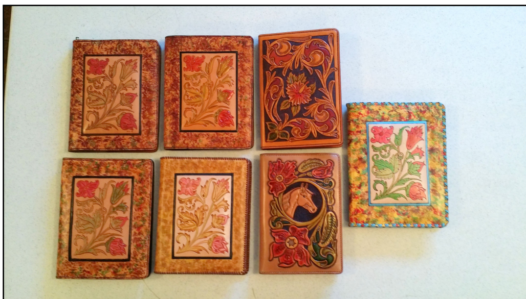
Finished notebooks (there are more but several members were out for the August meeting).