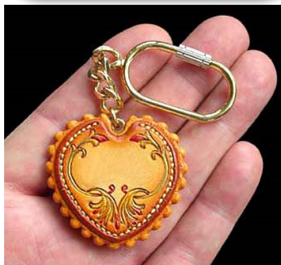
Happy Valentines Day from Peter Main