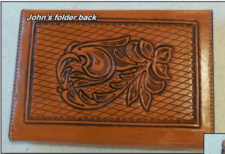
John's folder back