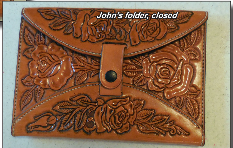
John's folder, closed