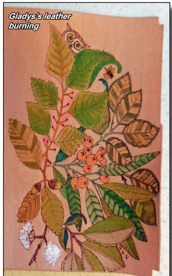
Gladys's leather burning