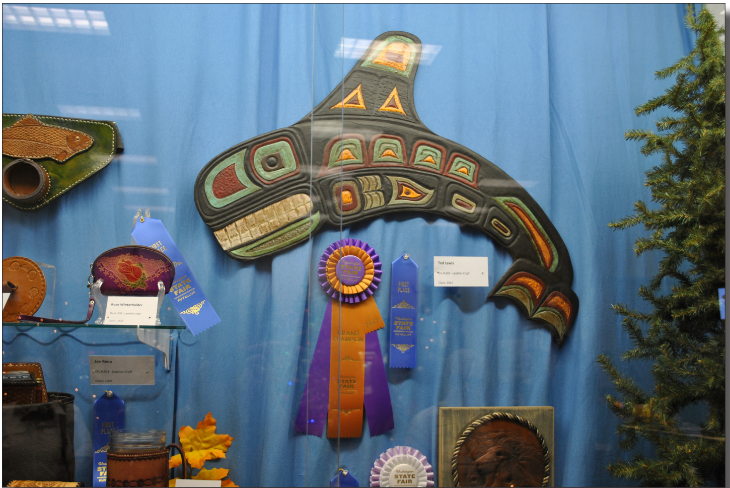
Grand Champion Orca for the Amateur Division